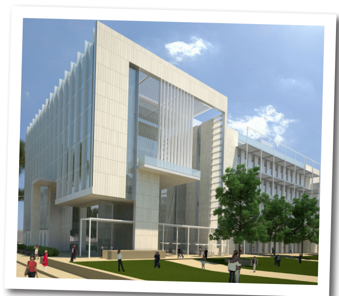
UCSD HEALTH SCIENCES BIOMEDICAL RESEARCH FACILITY IN LA JOLLA