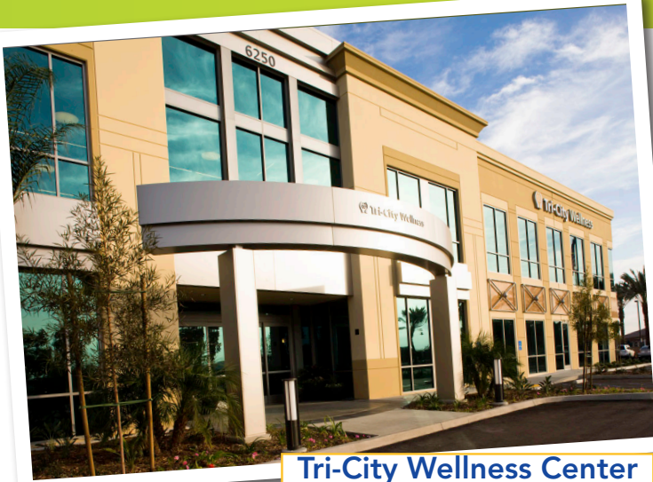
Tri-City Wellness Center 6250 El Camino Real

Opened in 2009, Tri-City Wellness Center is the only true hospital-owned fitness center in North County.